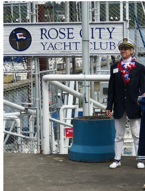
Images from last year's Opening Day

Happy Opening Day and I hope to see you there!