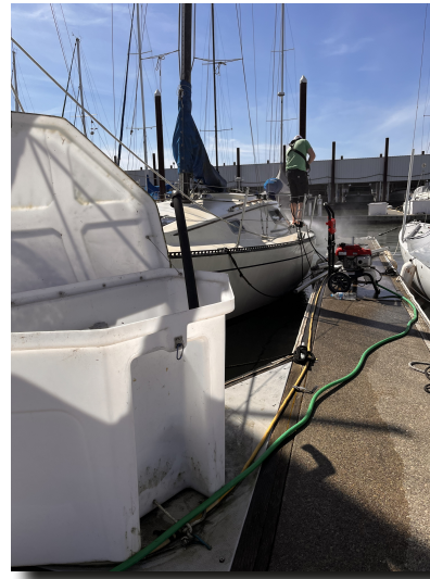
Boat Cleaning

Email articles, announcements and photos to: RCYCFoghorn@gmail.com by the 20th of the month