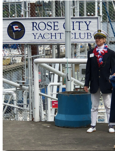
Images from last year's Opening Day

Happy Opening Day and I hope to see you there!