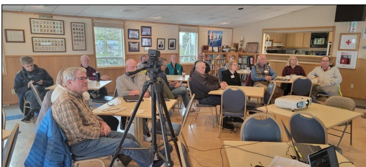
Training Session for Leads/Chairs was held live at the Clubhouse and on Zoom

More details will be coming, but what you will notice is that there will be some changes in practices at RCYC emphasizing the use of durable products for Club social events and an enhanced awareness of our use of utilities. If you have any questions contact me at rlphillips@web-ster.com .