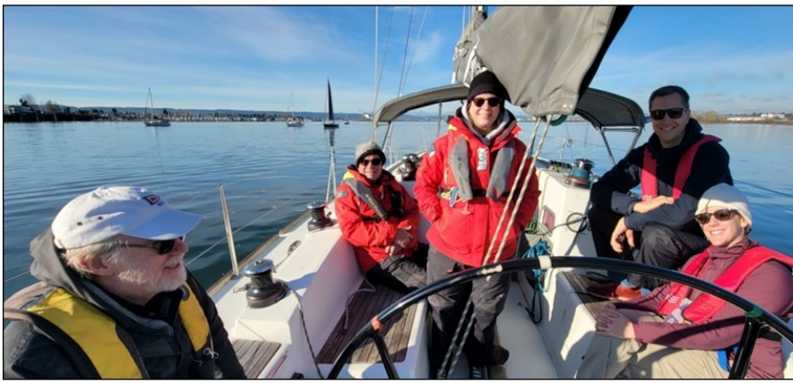
Insert photo caption.