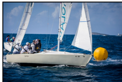
Stinger rounding the mark.