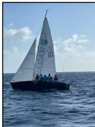
Black Pearl on a fast start.