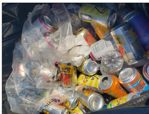
Plastics in the Returnables Bin NOT GOOD

Rounding, mast hauls hard hand over hand, heaves Until the bright sail is mast-headed. Trim hauls sheet and guy, spreading wings wide. Crumpf! The deep chute fills, broad-shouldered. Steel and sinew take the strain, transfer Loads to winch and hull. On the wave-top The bow lifts, stern sinks, and the sleek hull Rises on a plane, effortlessly.