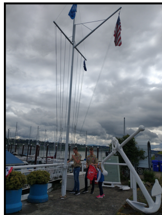
Opening Day at the Club.