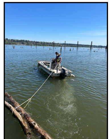
April 29 Work Party