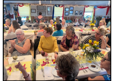
Lovely smiles and delicious dishes captured by Deedie Bassham. More photos on Page 9.