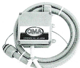
Low Chemical Alarm