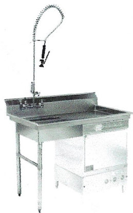
48" Undercounter dishtable with Pre-Rinse