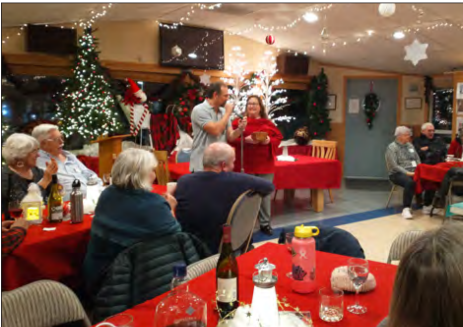
Christmas Ships gift exchange party.