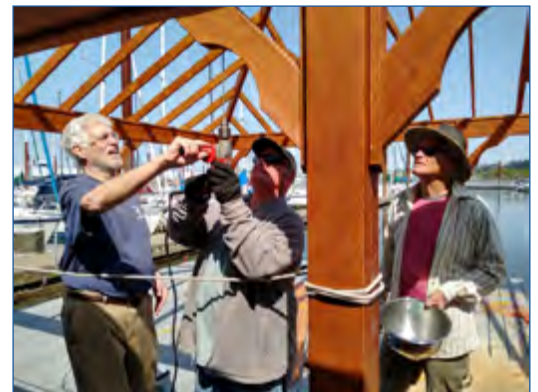
In the Do-It-Yourself spirit, we have a new patio. Thank you clubmembers who worked on this.