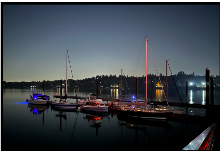
Night time at Bartlett Landing, Fall Foliage Cruise from the 7th to 9th.