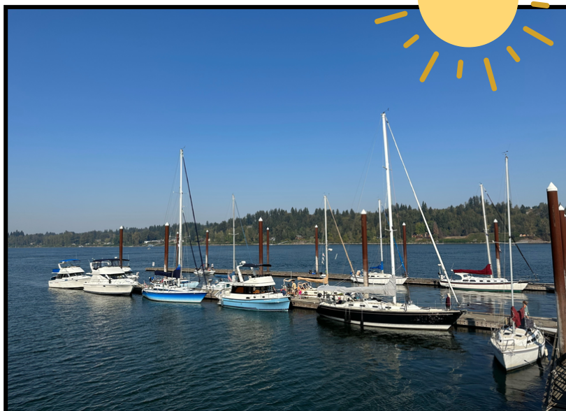
Day time at Bartlett Landing, Fall Foliage Cruise from the 7th to 9th.