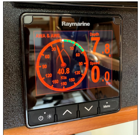
Auntie Em ... Auntie Em ... Rene' Emch wind gauge on Cando —September 11