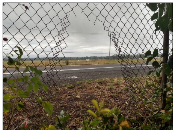
Another hole cut into the fence