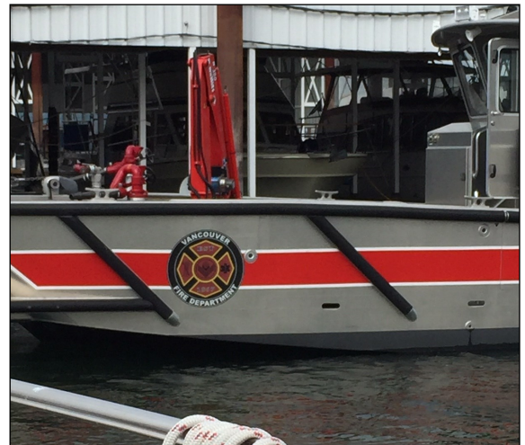
Liv Ormond watched the Fire Boat practice maneuvers on Walk 5 fairway