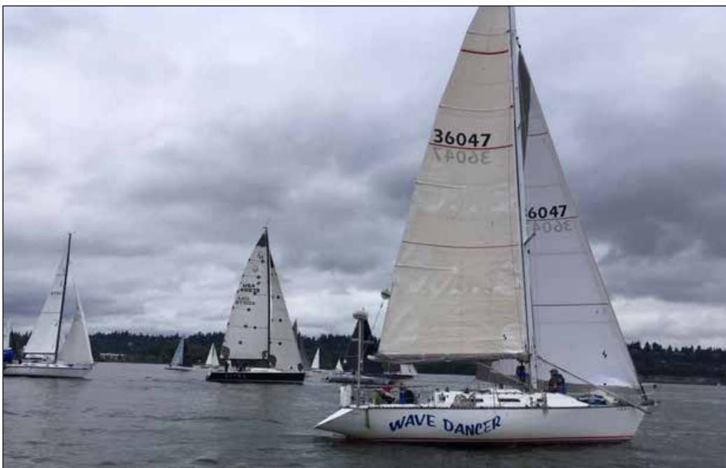
Wave Dancer works her way upstream during the RCYC Medium Distance Race, June 20.

Download a copy of the BoatUS Float Plan