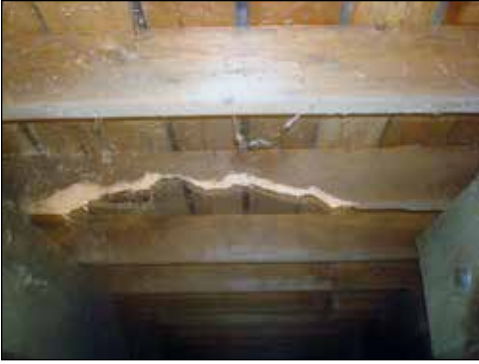
Floor joist under the clubhouse "The beaver wanted more headroom".