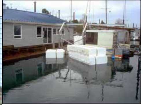
Foam flotation being installed.