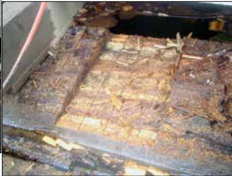
After 56 years these logs are in great shape with no rot