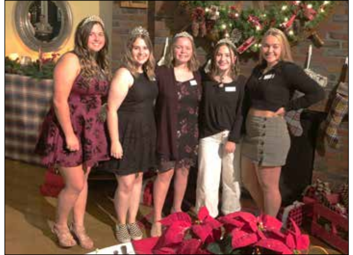
All five 2019 Daughters of Neptune together at CRYA Awards Banquet Dinner.