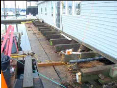
Work has started.