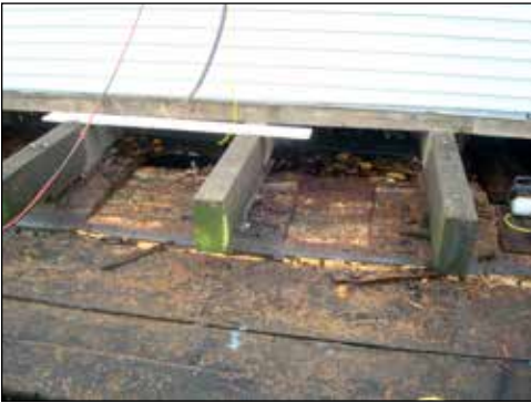
Notching out logs for new stringers and new flotation floats.