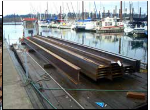
New steel stringer that will go under clubhouse.