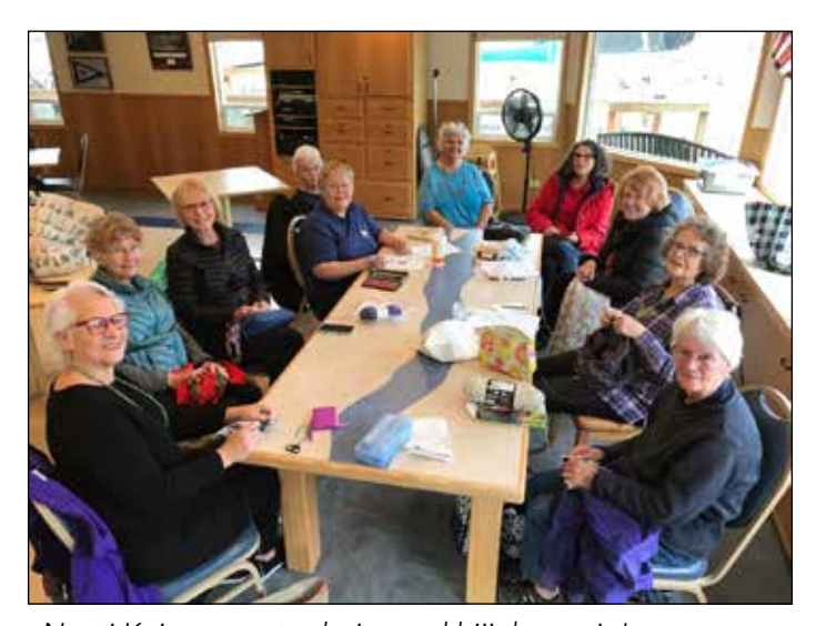
Nauti Knitters up to their usual hijinks again!