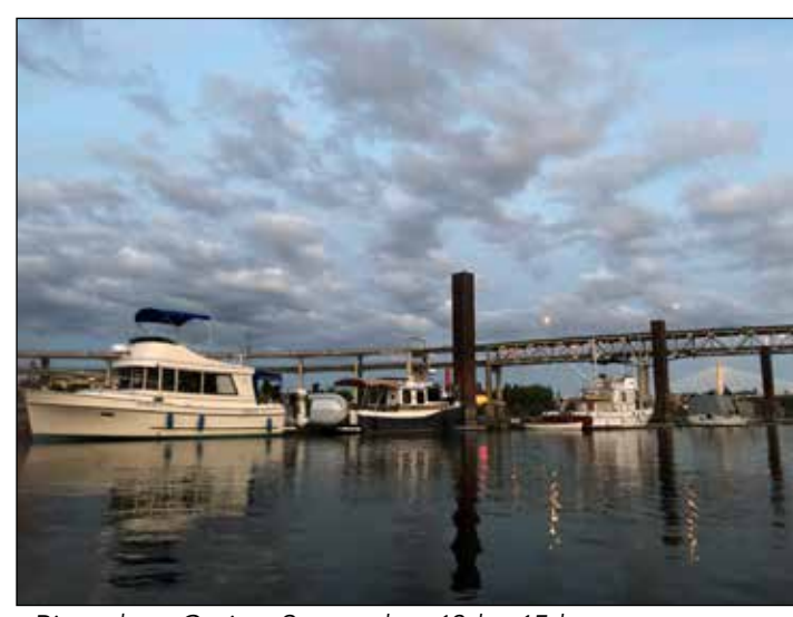
Riverplace Cruise, September 13th - 15th

November is when the Oregon Marine Board sends out notices to renew your two-year stickers. You can do the