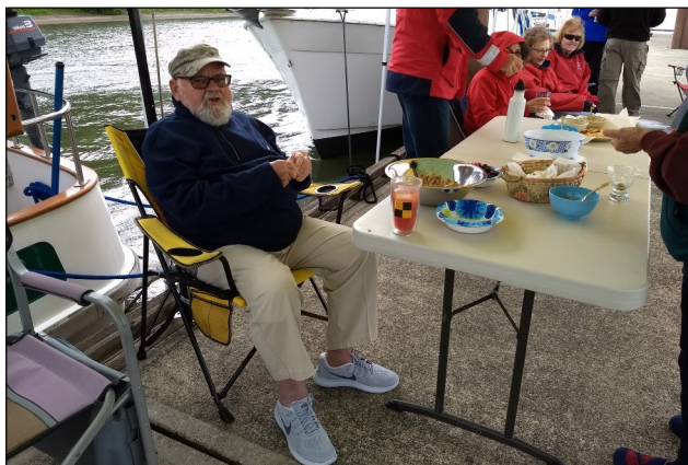
1st night RCYC Cruise to Bartlett’s You know it’s very cold out if Smoke is wearing pants!