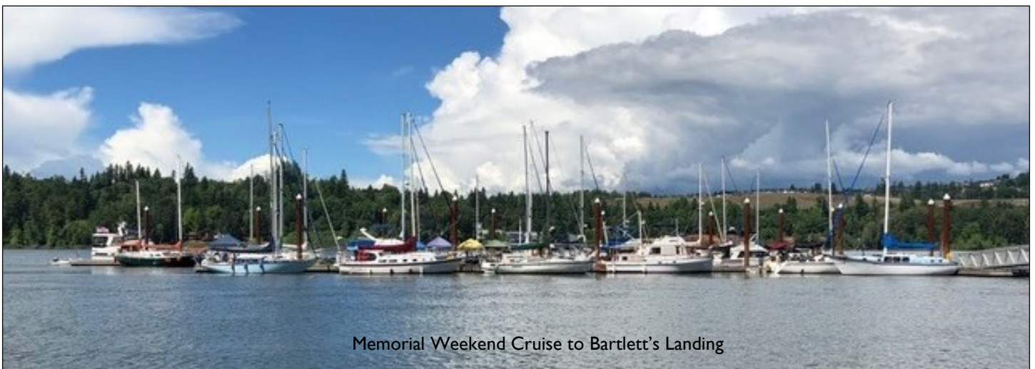
Memorial Weekend Cruise to Bartlett's Landing