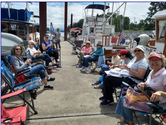
Knauti Knitters Outstation

Please lend a hand with your fellow Walk members!