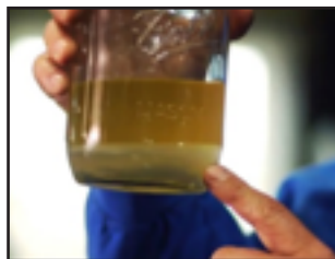
Phase-separated fuel will cause damage to boat engines and fuel systems

Putting your boat away for the winter soon? The Boat Owners Association of The United States (BoatUS) says recreational boat owners need to take special precautions with storage of E10 (10 percent ethanol) gas, and to review their insurance policy to make sure the boat is properly covered. Ethanol fuel can cause problems over the winter, and boats stored inside heated storage facilities may need to consider “ice and freeze coverage” for unexpected power outages. Here are two tips for helping to ensure your boat comes out of hibernation next spring ready to go: