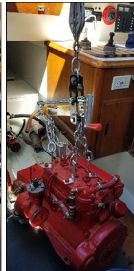
Close up of rigging & adjusting engine angle