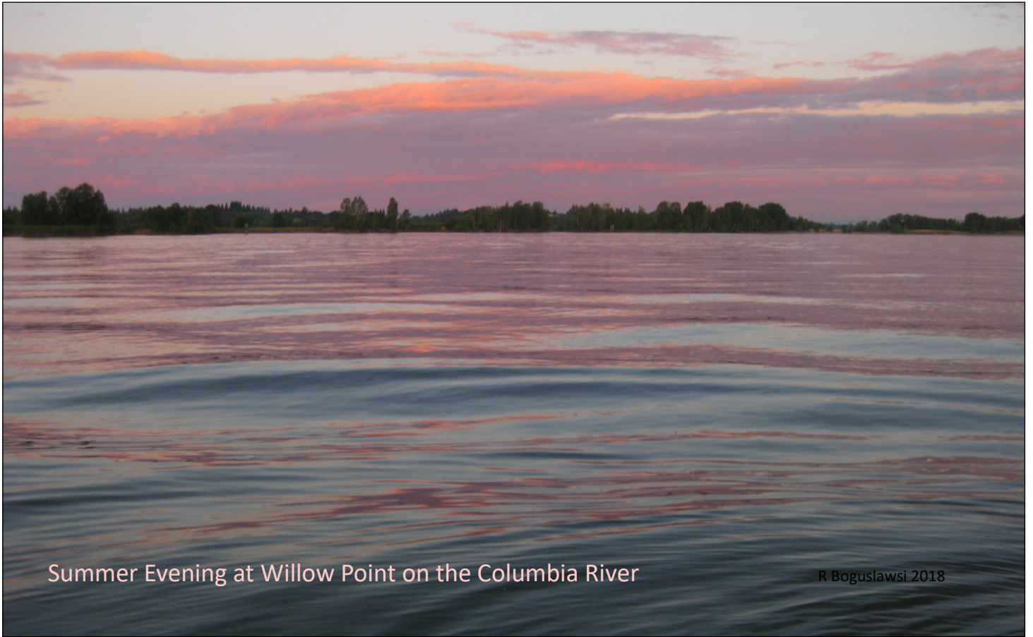
Summer Evening at Willow Point on the Columbia River