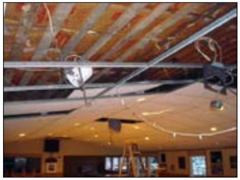
The rusted "T" bars and water spotted ceiling panels have been removed.