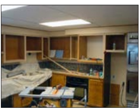
The upper cabinets have new face frames and are ready for the new doors.