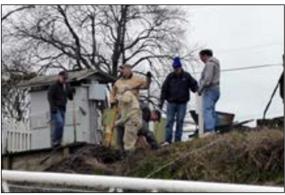
Commodores Past and Present and their winning team tackle the Sewer System on Sewer Bowl Sunday

St. Paddy's Day Potluck and Party will be held on Saturday, March 17th, and on March 24th is the RCYC Frostbite Regatta with its social after the event. Ladies, it's also time to prepare for the RCYC Ladies Dinner. First Mate