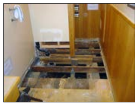
The rotten flooring has been removed and waiting for new pressure tread plywood to be installed.