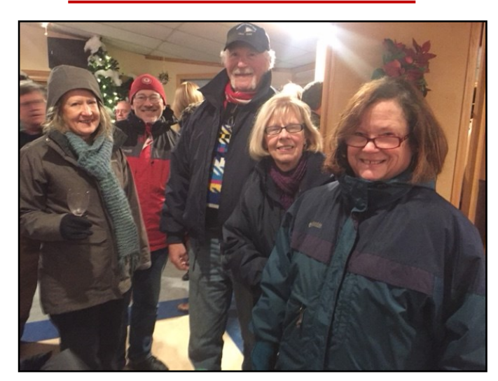
A chilly night watching the Christmas Ships