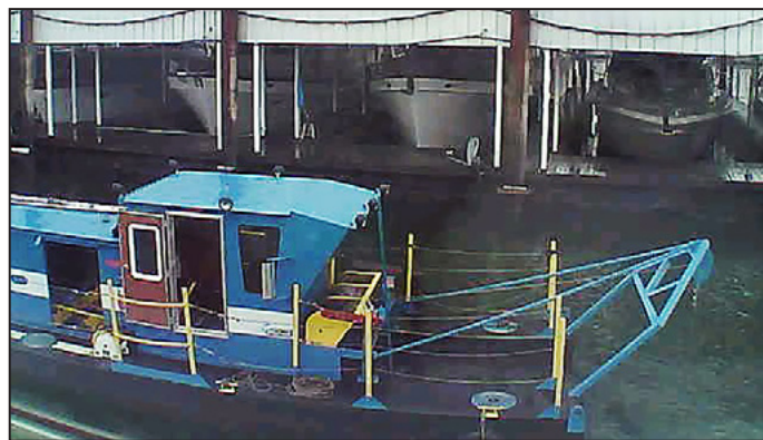
Our dredge at work

The dinghy docks now have Letter names posted on both ends.