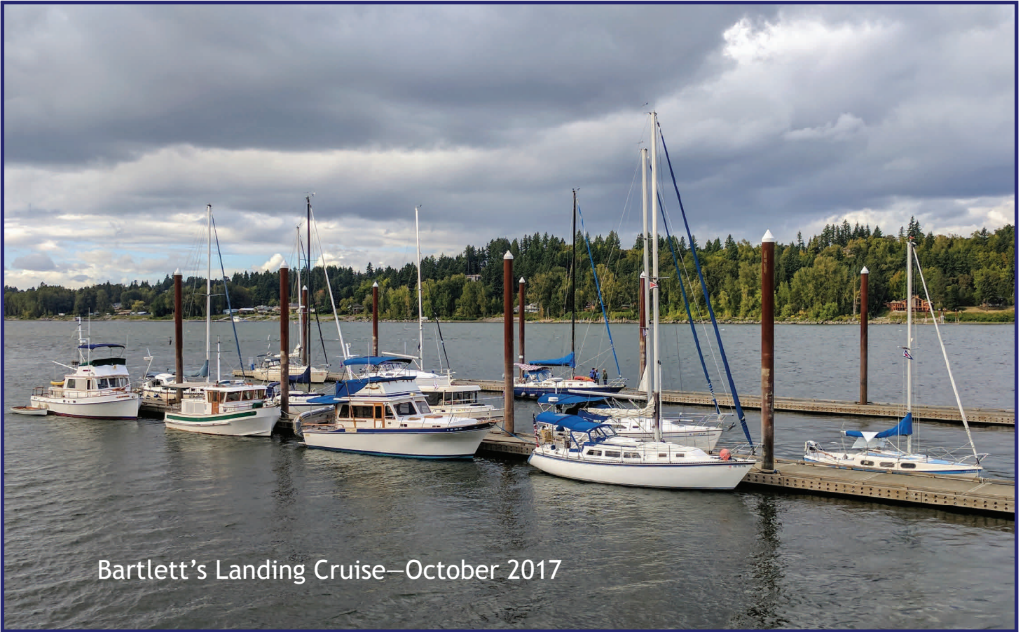
Bartlett's Landing Cruise—October 2017