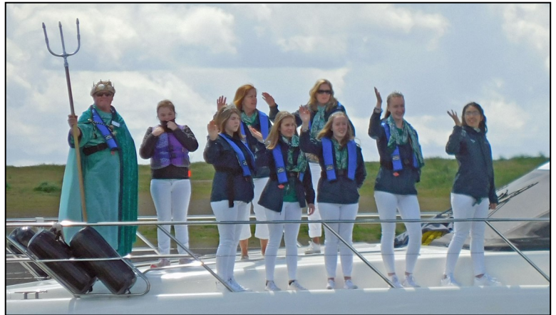
Neptune & Daughters on Opening Day

Numerous Club members have noted that we have an infestation of carpenter ants in the Clubhouse and I have been tasked with eradication. The insecticide is on order. By the time you read this, spraying will have commenced sometime before Memorial Day weekend. Spraying will be both inside and outside the Clubhouse. This will be an ongoing process that will comprise a couple of spray periods throughout the summer months.