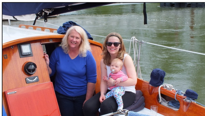
High Water at Bartlett's Landing—April 2017