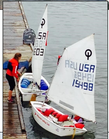
Below: Cascade Locks