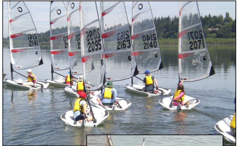
Top: Vancouver Lake

I would very much like to know when you have children, or children you know, in classes. I like to check in to see how they are doing and get some photos.