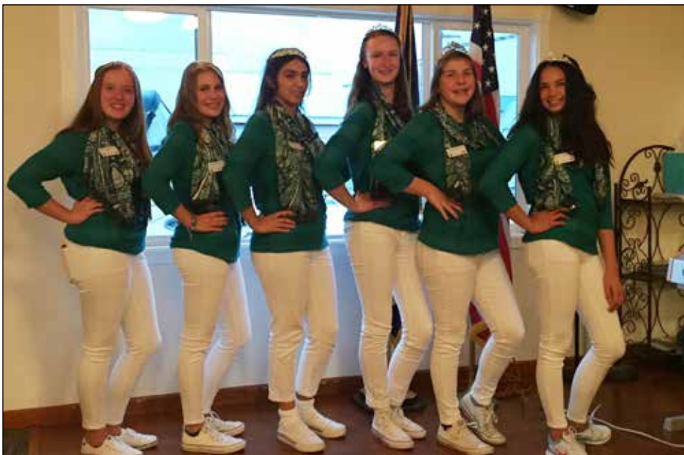
Daughters of Neptune together at the Tyee Ladie's Dinner, April 19.

This is not be construed as an endorsement of BoatUS by Rose City YC or its officers. However, more than sixty RCYC members have taken advantage of this co-op group rate.