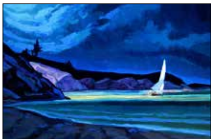
The Reach III, By Edward Hopper