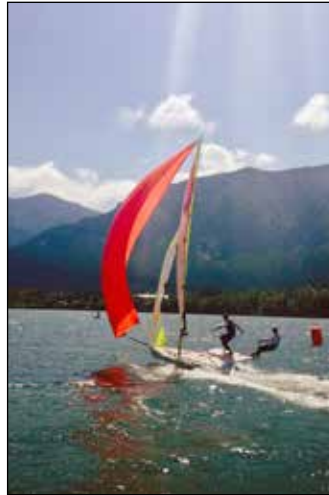
CGSA this summer