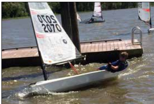
Coming in for a landing!