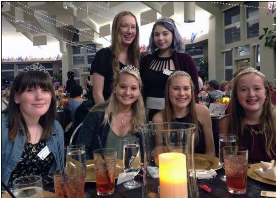
Daughters of Neptune at the Columbia River Yacht Club Ladies Dinner.