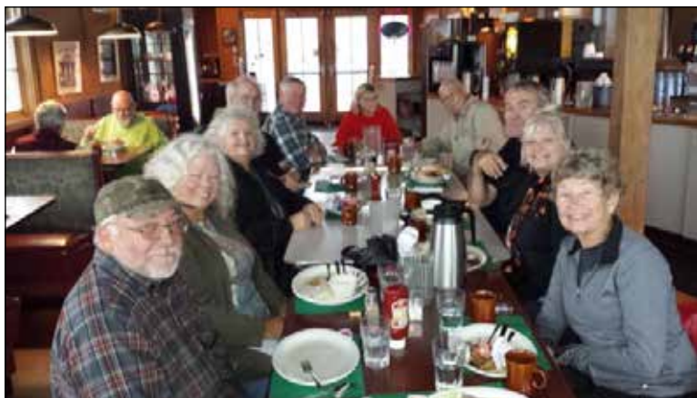
Several RCYC members on a land cruise to La Push, Washington