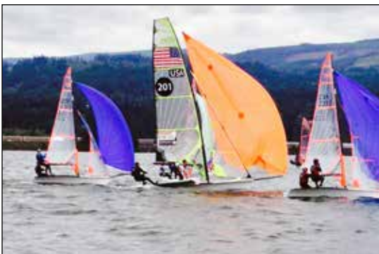
Youth at Cascade Locks