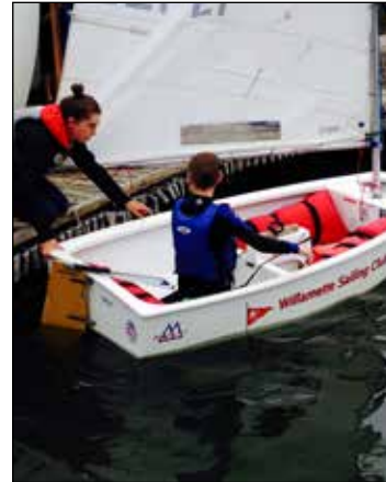
Ready, Set, Go!