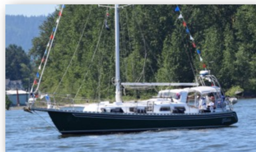
S/V Tamara on Opening Day