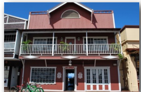
Lahaina Yacht Club - Maui

Visiting other clubs is fun and offers an opportunity to meet other boaters and make new friends. Have a wonderful summer cruising.