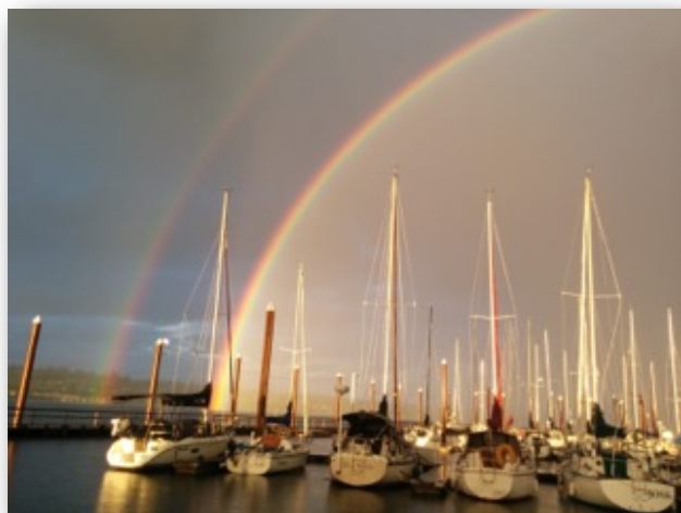
Rose City Yacht Club illuminated on a recent spring day.

Jim Lynch lives outside of Olympia, Washington and is a sailor. His books all deal with the wonders of Puget Sound and a love of boats and water.