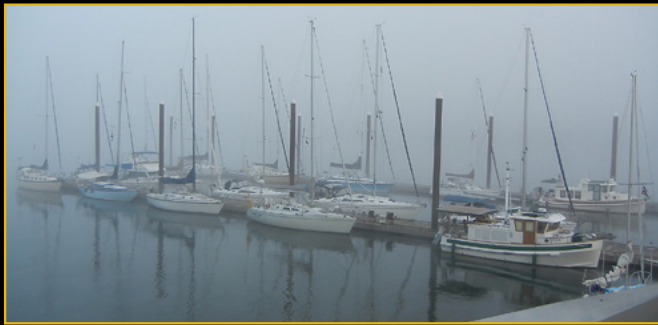
A Foggy morning turns into a sunny day for the East Dock Cruise