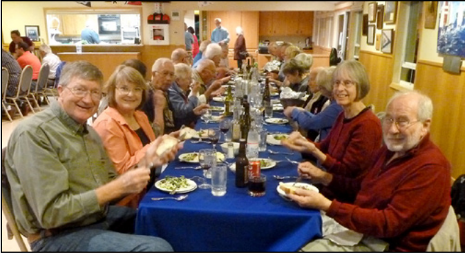
Old Salts Dinner – mark it on your calendar for next year.