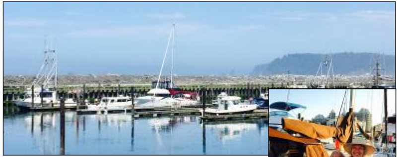
Waiting on weather in La Push—Not too bad!