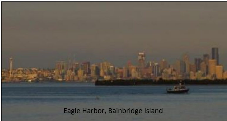
Eagle Harbor, Bainbridge Island