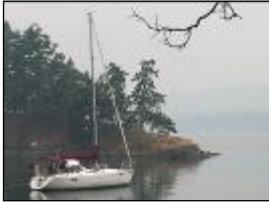
Wildfire smoke Conover Cove, Wallace Island, BC Gulf Islands