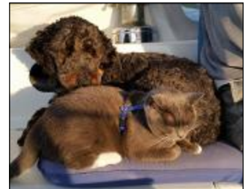
Novice sailor Salty Dog Maggie and the world voyager, Ship's Cat Moo Moo, share a "princess cushion"