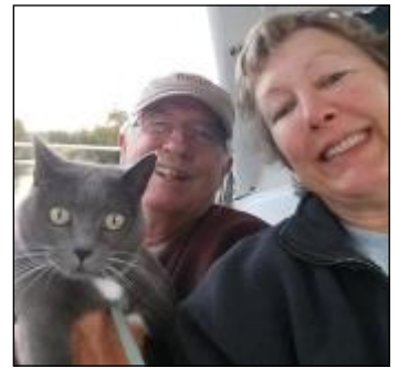
Moo Moo had us all to herself on the lower Columbia and our ocean passages