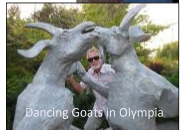
Dancing Goats in Olympia