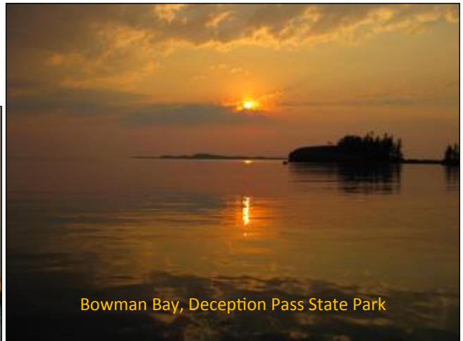
Bowman Bay, Deception Pass State Park