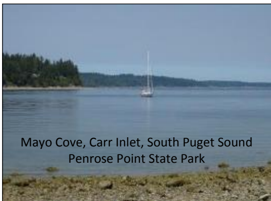
Mayo Cove, Carr Inlet, South Puget Sound Penrose Point State Park