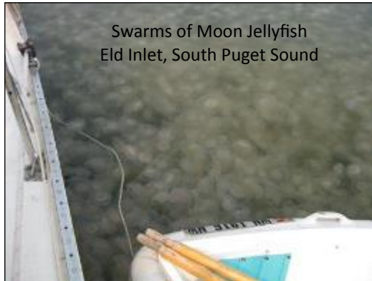
Swarms of Moon Jellyfish Eld Inlet, South Puget Sound