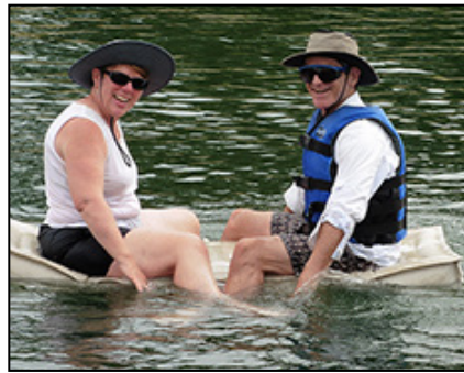
RCYC members enjoying music on the dock in Cathlamet to fun in the sun at the Pirates' Cruise.