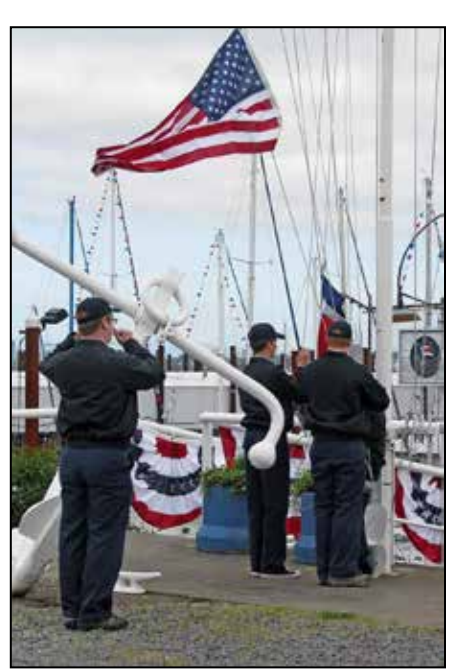
Flag Ceremony by the City of Roses Ship