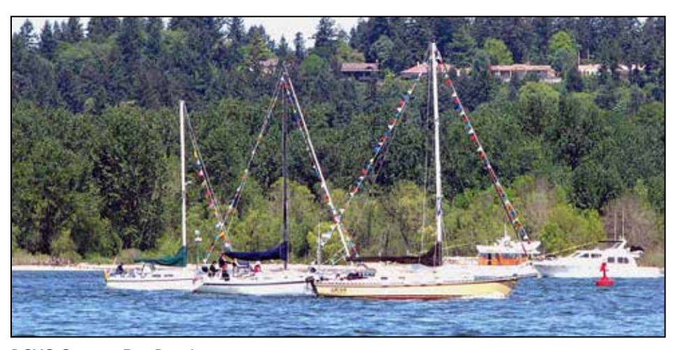
RCYC Opening Day Parade