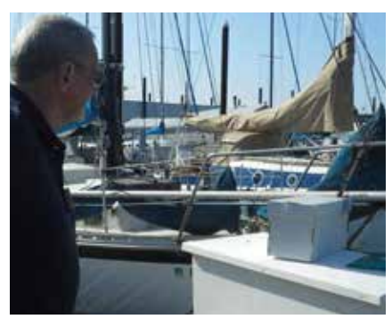
Snug as a bug in a Box!