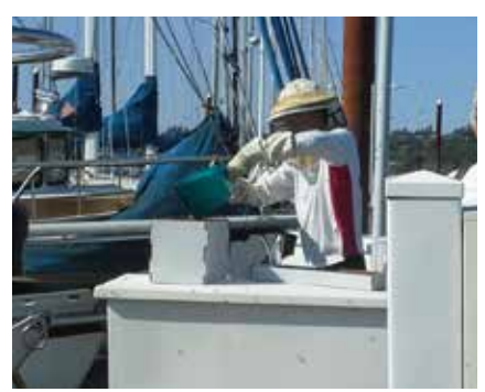
Bee Keeping at the Club