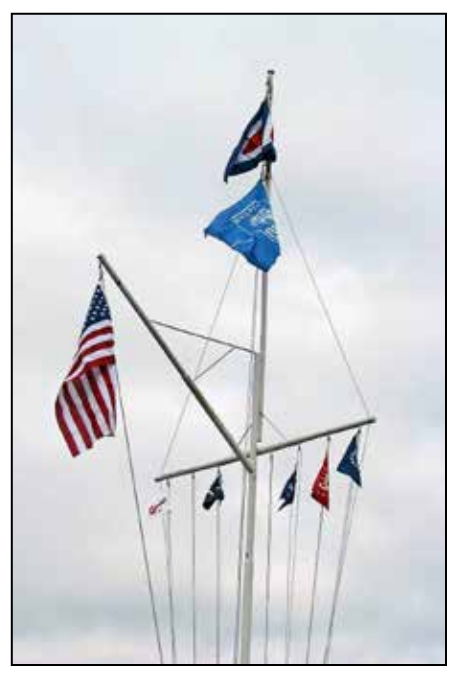
Colors Hoisted - The Season is Launched