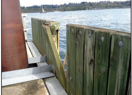
Damage to the wall on Walk I's NE corner. This happened sometime between last Wednesday April 8th and Friday April 10th around 1pm. Tom Stringfield has ordered the materials needed for the repairs.

I hope to see you on the upcoming cruise – Fair winds.