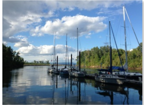
Coon Island- East Dock

I'll close with this thought - summer is past and winter months away. Fall cruising is fun!