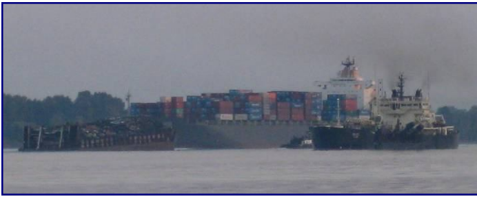
Ship traffic on the Columbia River