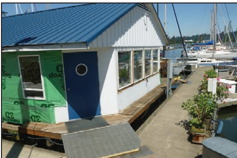
New siding gives our club a great new look.