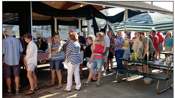
Lazy Days potluck in Cathlamet

We have a future opportunity in which the Sheriff will do a physical inspection of the moorage. This inspection will