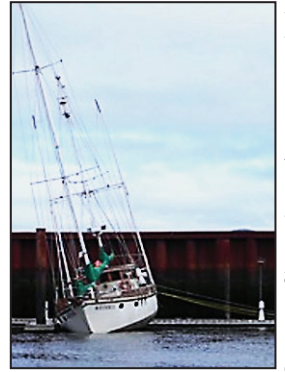
Beware of low tides in Astoria west dock.