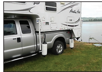
Tom and Vickie's land yacht ready to raft up in Cathlamet during Lazy Days.