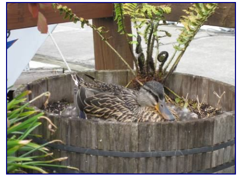
All the commotion didn't ruffle this Mom's feathers