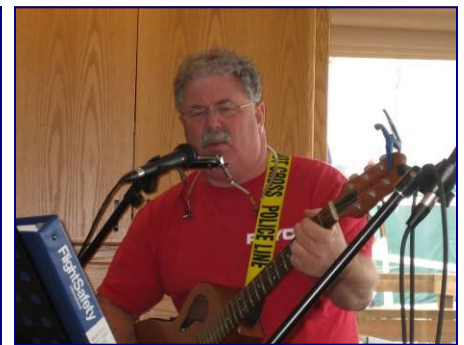
aka Neil Young