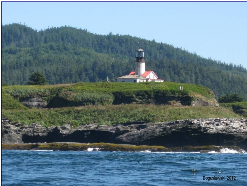
Cape Flattery Lighthouse on Tatoosh Island—Juan de Fuca Strait Entrance

If you find discrepancies this summer, with what is listed in the Yearbook, please let us know at tcrcyc@gmail.com and we'll get it corrected.