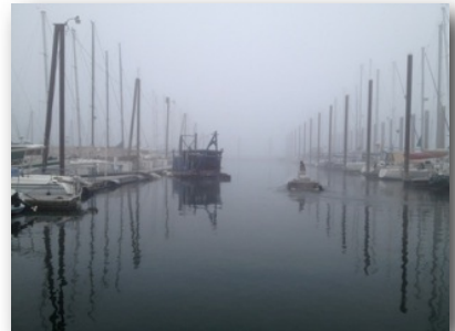
Dredgers working in the cold