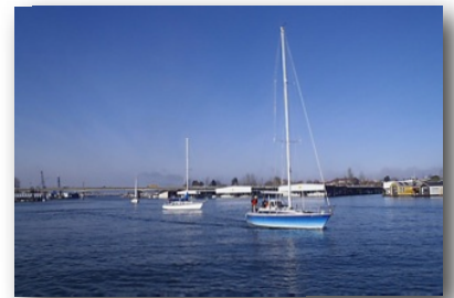
RCYC Soup & Sail boats