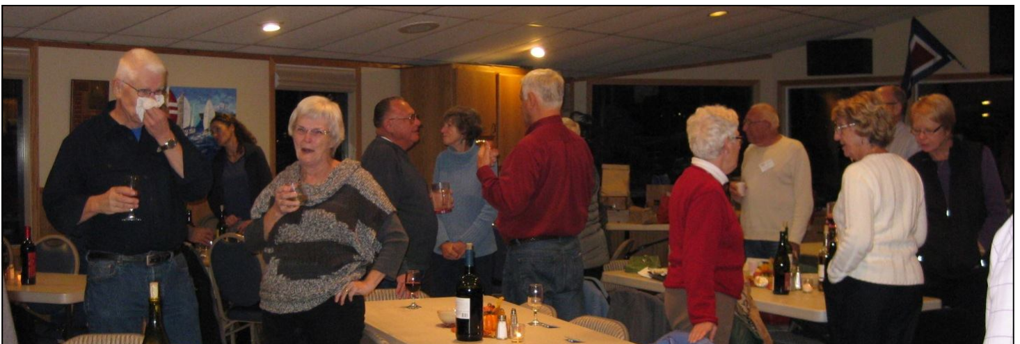
Walk 5 BBQ & Auction getting underway