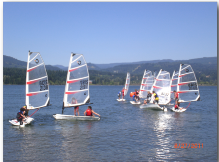
Youth sailors in Open Bic's

The RCYSS will now be using RCYC's address: 3737 NE Marine Dr., Portland, OR 97211 for all correspondence. Please make sure your check, letter, or note is clearly marked for youth sailing. We will be checking the mail at least once a week at the club. If you do not get a receipt, please check with us to make sure we received it. Feel free to call or email me. My contact information is in the yearbook. I love hearing from you. Please keep me busy.