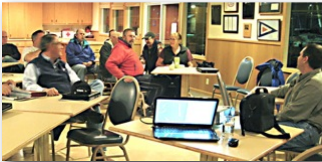
RCYC Radar Education Class