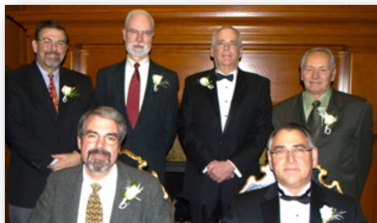
2011 RCYC Officers and Directors

Remember reason thirty-five when you are approached to serve as a director or officer. It is a commitment no doubt. But how else will you be able, formally, to bring individuals into the RCYC family?