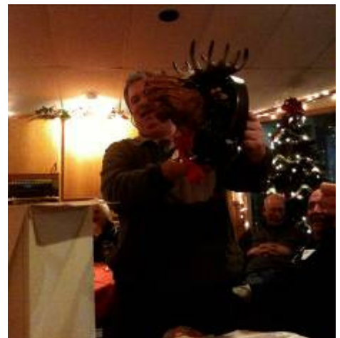
Wow, I get all the good gifts!