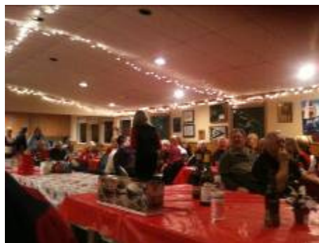
An RCYC captive audience wonders whose gift will be stolen next?