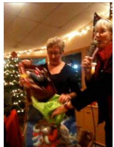
Another present ripe for the taking.