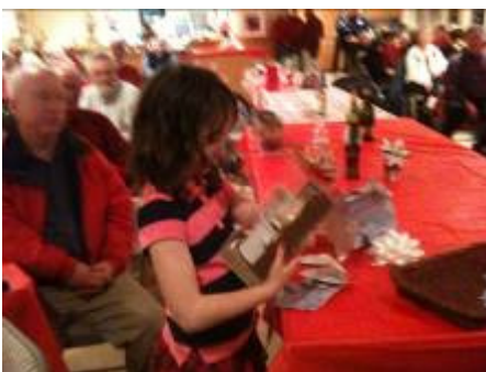
Not another dumb adult gift?