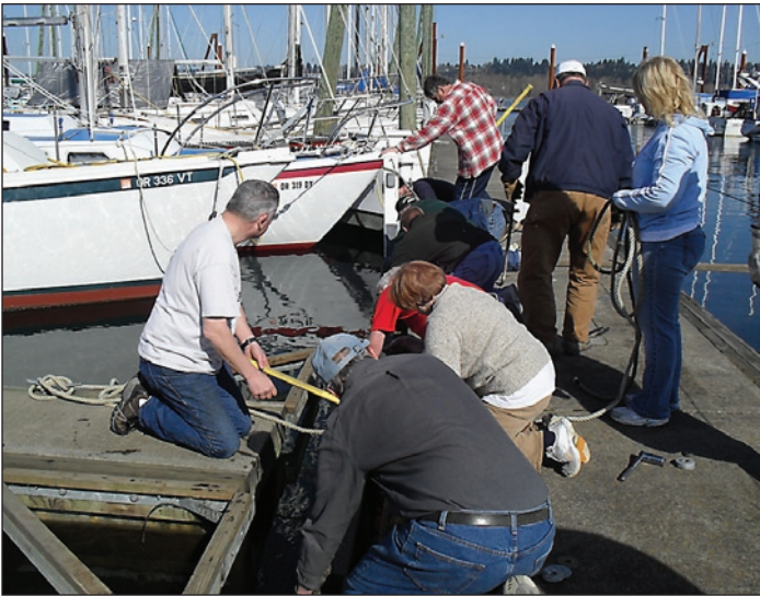
Whaler replacement, Walk 3.

I know that some of these folks were formerly lots more active a couple of decades ago and their recreational interests may have changed. We are left with a few boats that are in terrible-looking condition, and not only are arguably unsafe to use but probably do not have functioning engines to enable them to get under way.