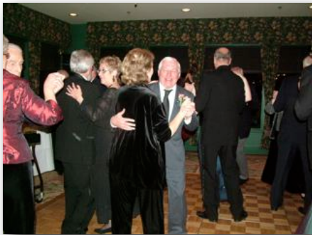
2009 Commodore's Ball

Please indicate choice of prime rib or salmon for each reservation.