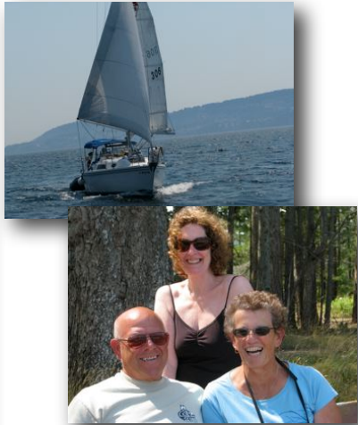
Thinking warm thoughts!

Receive your Foghorn as a PDF file and save the Club the cost of printing and postage.