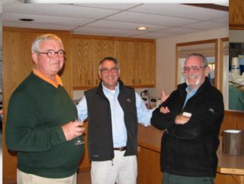
Old Salt's Dinner