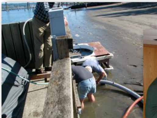
Work Party clearing sand from walk 1

In 2009 a LOT of members did a LOT of work on floating structures, ramps, walks, and finger docks. We now enjoy one of THE finest moorages on the River. Without all your work we would not be at this point, and only with your continuing contribution will we stay this way.