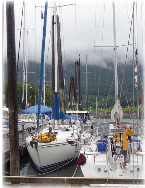
LABOR DAY WEEKEND CRUISE AT BEACON ROCK

As you are filling in your calendar for fall and winter, be sure to pencil in the time to be part of RCYC activities. Getting outside in spite of the weather, getting together with boating friends to work and to play has to be one of the best, natural, non-narcotic ways to fight the seasonal blahs.