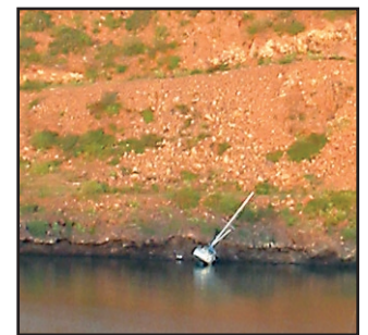
One of a dozen or more boats that broke loose from moorings during the storm and ended up on the rocks.