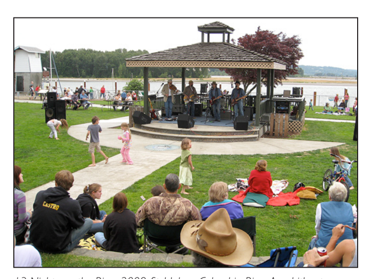
I 3 Nights on the River 2009, St. Helens Columbia River Amphitheater. Live music at 6 pm Thursday nights, Friday night movies at dusk. For schedule: <a href="https://www.13nightsontheriver.com">www.13nightsontheriver.com</a>.

It is with great joy I support sailing in our area.