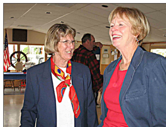
Opening Day Celebration