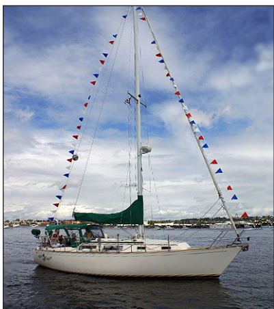
Opening Day Celebration