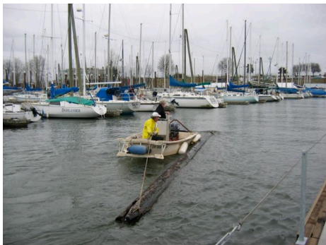
March work party moving logs

Any members interested in these flexible work-hour earning positions for the coming season should notify the Board.