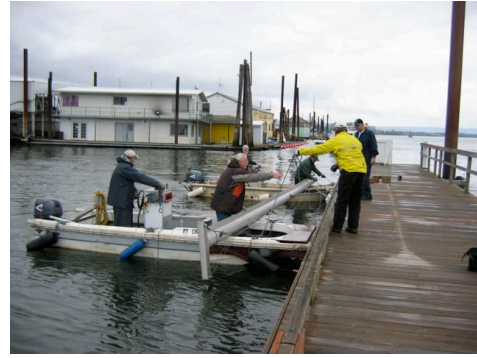
March work party installing mast puller