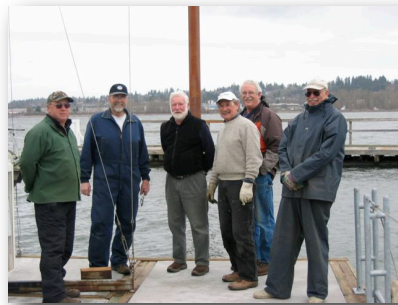
Work Party Crew

We had a good turnout for our first spring work party. One result is we again have city water available on the docks. Opening Day is not too far off, so you might start thinking about cleaning up your boat for the new season. The St. Patrick's Day potluck was fun. The Yeates Academy of Irish Dance provided excellent entertainment. The hard shoe dances were particularly impressive, and our floor survived undamaged.