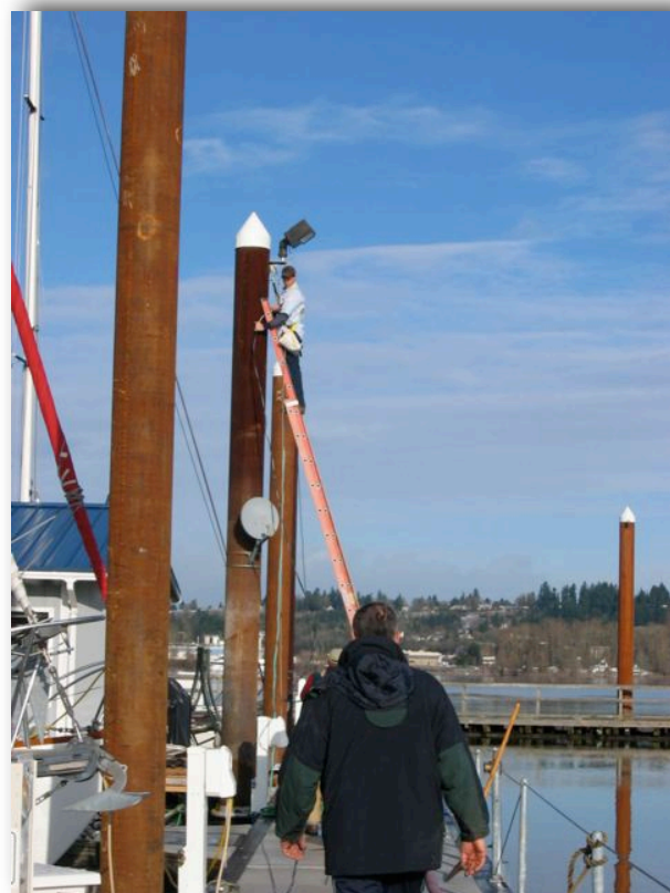
Wiring lights on new pilings