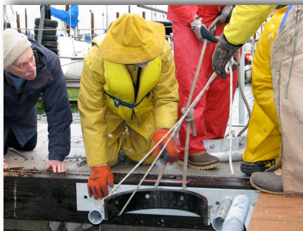
Preparing for new pilings