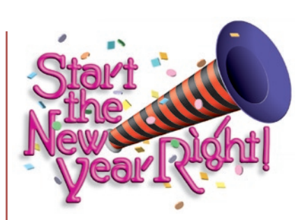
SOUP AND SAIL January 1st at the Club