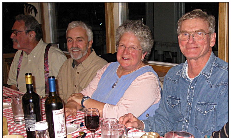
Club members enjoying the Old Salt's Dinner