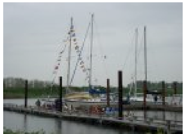
Memorial Day cruise to Hadley’s Landing